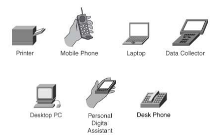
Figure 1: Computer Devices for Wireless Networks Satisfy Different Applications [3]

The term "Wi-Fi" is abbreviation of "Wireless Fidelity". This term is comparing with the long-established audio recording term "High Fidelity" or "Hi-Fi"."Wireless Fidelity" has often been used in an informal way, even by the Wi-Fi Alliance itself, but officially the term does not indicate anything. The term "Wi-Fi", first used commercially in August 1999, was coined by a brand consulting firm called Interbrand Corporation that had been hired by the Alliance to determine a name that was "a little catchier than 'IEEE 802.11b Direct Sequence'."Interbrand invented "Wi-Fi" as simply a play-on-words with "Hi-Fi". In figure 1, there are several types of devices and applications that supported to use Wi-Fi network. [1]