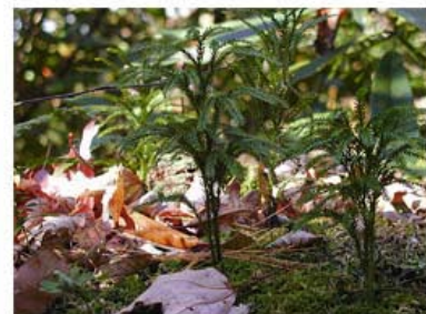
File Type: GIF, lossless compression Size: 286 k but only 256 colors