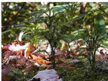
File Type: JPG, absurdly high compression Size: 18 k