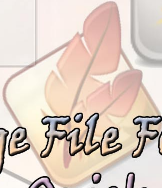
Image File Format In a Quick Look