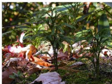
File Type: PNG, lossless compression Size: 741 k