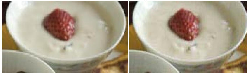
Lossless Image Compression

Lossy compression algorithms take advantage of the inherent limitations of the human eye and discard invisible information. Most lossy compression algorithms allow for variable quality levels (compression) and as these levels are increased, file size is reduced. At the highest compression levels, image deterioration becomes noticeable as "compression artifacting".