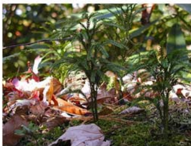
File Type: JPG, medium quality Size: 188 k