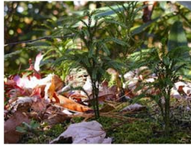
File Type: Tiff, LZW lossless compression Size: 928k (yes, its actually bigger)