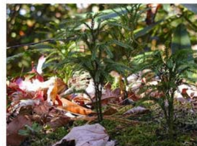
File Type: JPG, low quality / high compression Size: 50 k