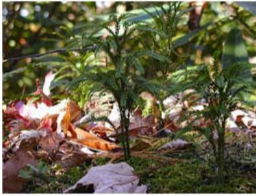
File Type: Tiff, uncompressed Size: 901 k