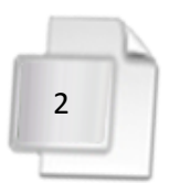
Image File Format In a Quick Look