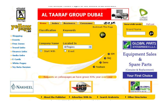
Fig. 1. Web site of UAE Yellow pages by Etisalat company

This system can be applied to the tourism industry. People around the world will be able to visit UAE in virtual reality. They will be able to have a virtual visit to tourist destinations of UAE such as museums, forts, sougs, the Palms [4], the