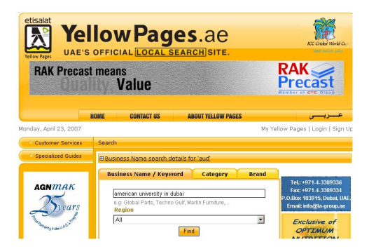
Fig. 2. A Search on Etisalat Yellow Pages using AUD as an example.