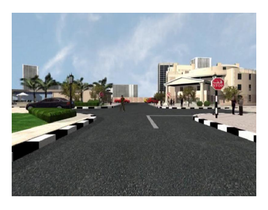
Fig. 5. The new system will give virtual reality driving direction to a given location

Imagine visiting great tourist landmarks in UAE in virtual reality and being able to see it at some point in the past and also for many projects under construction how it will look like in the future. These virtual reality shows of future projects are already widely used by the construction industry for promotional purposes. We will just add these VR shows to our platform at the point in time when it is scheduled to be complete.