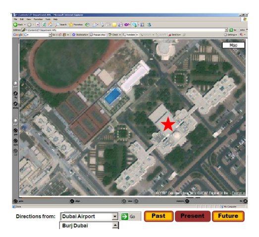
Fig. 4. Satelite map of AUD location.

Furthermore, we also propose to add 3D views from the past and in the future for tourism landmarks. This is what is meant by 4D, in other words, the fourth dimension is time.