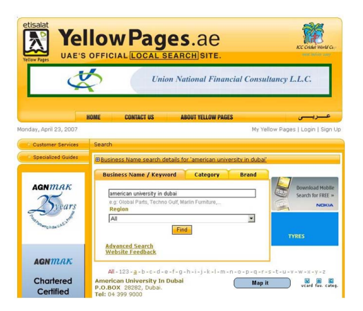
Fig. 3. A Search result page from Etisalat Yellow Pages using AUD as an example.

of the road and landmarks around it as illustrated in Figure 5. This will add a significant value to business directory. Currently, the UAE business directory does not have any mapping features. People resort to looking the address in a 2D map which is usually very hard to find, especially for visitors and new comers. Even if the user finds the exact location on the map, it is usually difficult to find the correct driving rout to the location. Our system will allow the user to drive to the wanted location in virtual reality. Thus he will know the correct way to get to the location before going on the road and lose time and money looking for the place. This will also help reduce accidents on UAE roads, since people will focus on driving instead of looking at signs and landmarks.