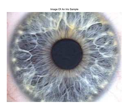
Fig. 1. Image of a sample iris

The visual appearance of an individual and in particular his/her iris is highly distinctive, therefore, it has promise as a basis for robust biometric assessment. We have shown that optimal feature selection together with Fourier descriptors and a simple statistical classifier operating on the contour irises can results in reliable iris identification systems. The proposed system is simple, has a low a computation complexity, and is robust to additive noise.