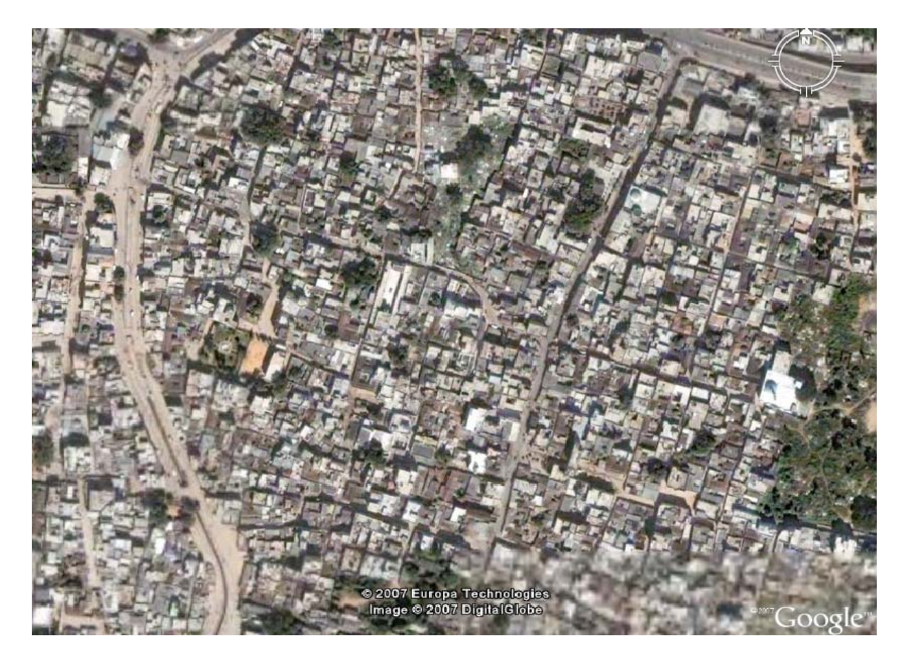
An example improper zoning and improper transportation facilities (17degrees 21' north: 78degrees 29' east)