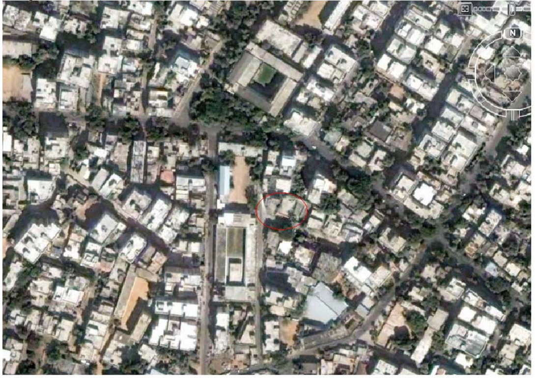
Improper zoning: Location of pharmaceutical company within the residential area of Narayanguda (17degrees 23' north: 78degrees 29' east)