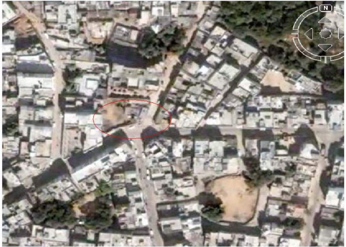
Improper zoning: Location of farms within the residential area of Mallepally (17degrees 23' north: 78degrees 27' east)