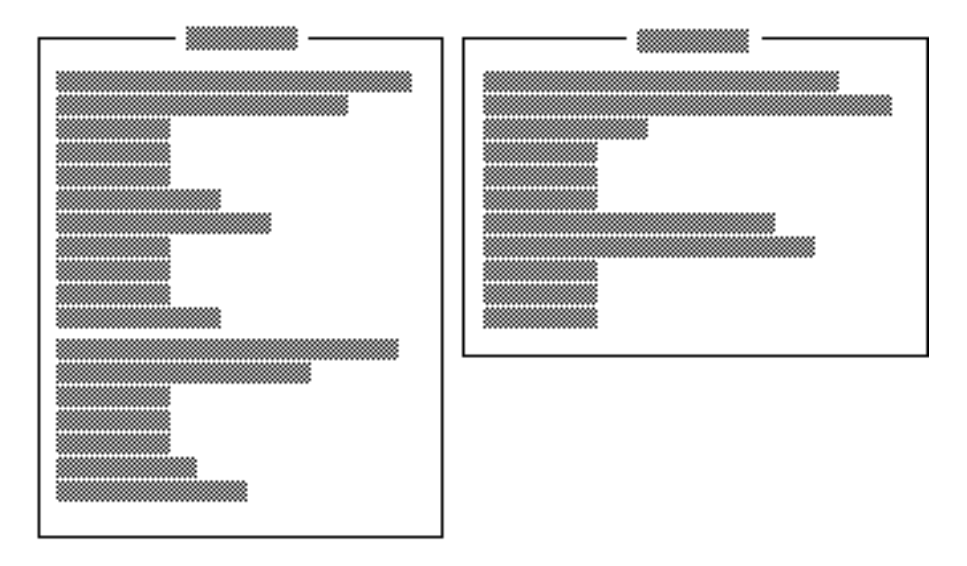
Figure 8.3 Using PUBLIC and EXTERN

In the following example, the procedure BuildTable and the variable Var are declared public. The procedure uses the Pascal naming and data-passing conventions: