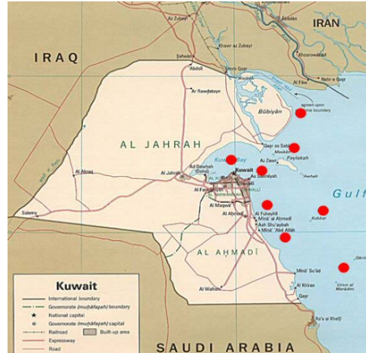
Figure 4. The State of Kuwait Map with the locations of the buoys shown.