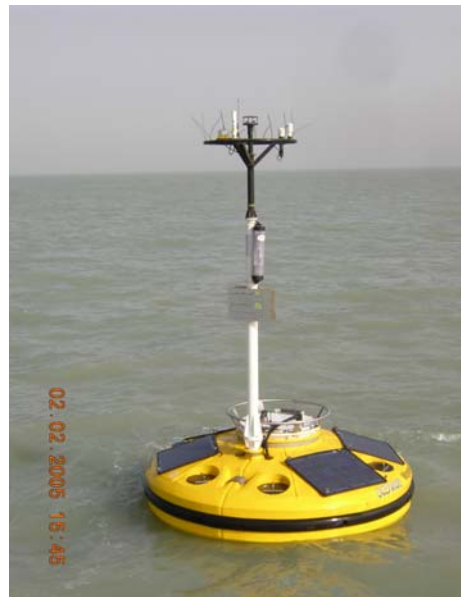
Figure 1. Example of the buoy system deployed in the Kuwaiti water territories.

The system consists of several large buoys that have the capability to monitor the gulf environment, Fig. 1. The system is designed to absorb repeated collisions and abrasion.