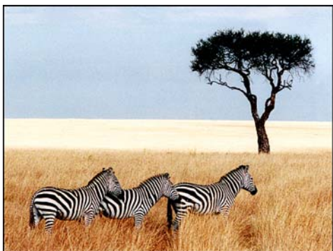
Fig. 2. Stego-Image containing secretly embedded message

message reveals the secret message “Pershing sails from NY June 1”.