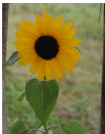
Fig. 4. Cover Image in GIF format

The above message is embedded in the cover image GIF file shown in Fig. 4. The stego-image containing the above embedded message is shown in Fig. 5.