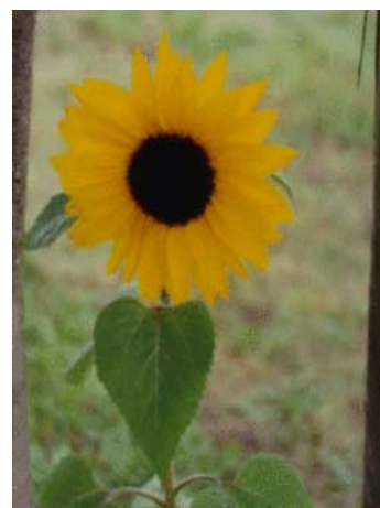
Fig. 5. Stego-Image containing secretly embedded message

The secret message is revealed from the above message by extracting the embedded message and applying the transformation as mentioned above.