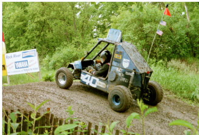
Figure 1: Penn State Altoona's 2000 Mini Baja Entry

Another student design project which helps to provide both good design and management experiences for students at Penn State Altoona is the Society of Automotive Engineers (SAE) Collegiate Design Series Mini Baja®. The SAE Mini Baja 23 is an international competition that pits student teams from around the world against each other in design, construction and testing of an off-road vehicle. The vehicle (Penn State Altoona's 2000 vehicle is shown in Figure 1) is a single-seat, four-wheeled vehicle, powered by a 10 horsepower gasoline engine, which must be designed to be marketable for a 4000 unit production cost of less than 3000USD.